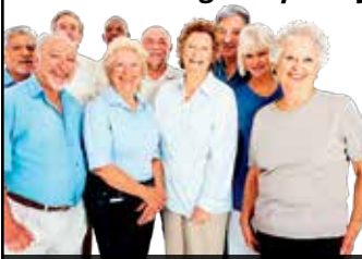
Family Owned & Operated